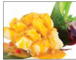
Sakura Chilean Seabass