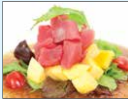
Tuna Mango Salad $12