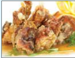
Garlic Butter Soft Shell Crab $9