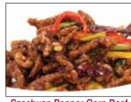
Szechuan Pepper Corn Beef