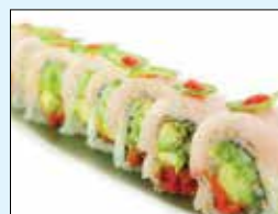
Crazy Yellowtail Roll $13