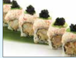
Sexy Roll $12