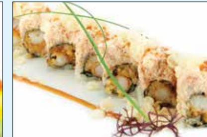
Dancing Rock Shrimp Roll $13