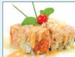
Spicy Girl Roll $12