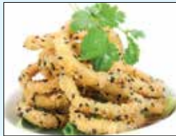
Crispy Calamari $8