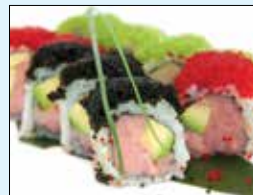
Rainbow Tobiko Roll $13