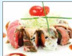
Angel Roll $13