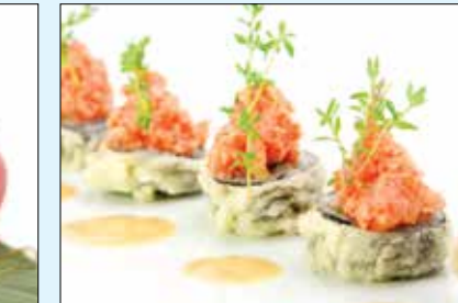
Crispy & Spicy Roll $13