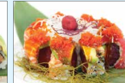
Ichiban Roll $12