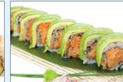
Volcano Roll $10