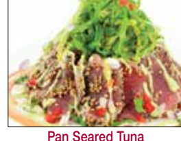
Pan Seared Tuna w. Soba Noodles