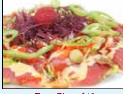
Tuna Pizza $12