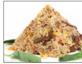
Malaysia Fried Rice