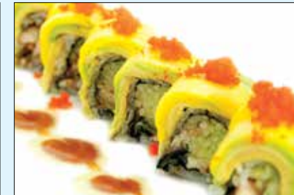
Mango Dragon Roll $12