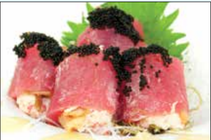
Spicy Lobster Cha La Ca $11