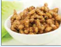
Chicken Lettuce Wrap $8