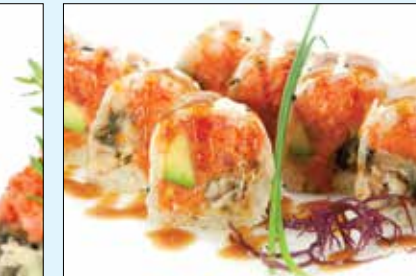
Bethpage Roll $13