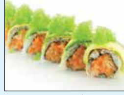
Hulk Roll $13