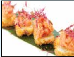
Crispy Rice $12