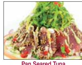
Pan Seared Tuna w. Soba Noodles