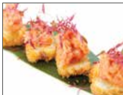
Crispy Rice $12