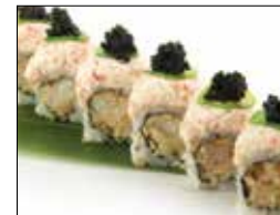
Sexy Roll $12