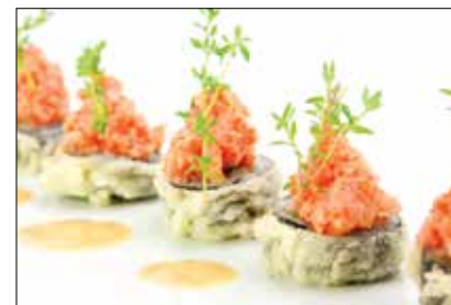
Crispy & Spicy Roll $13