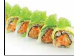
Hulk Roll $13