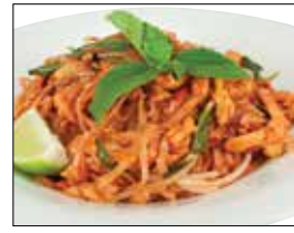
Chicken Pad Thai