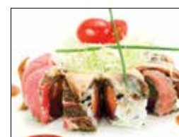
Angel Roll $13