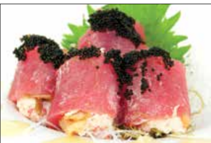
Spicy Lobster Cha La Ca $11