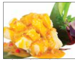
Sakura Chilean Seabass