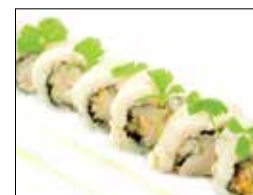
Crazy White Tuna Roll $12