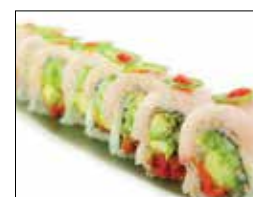
Crazy Yellowtail Roll $13