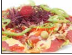
Tuna Pizza $12