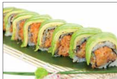
Volcano Roll $10