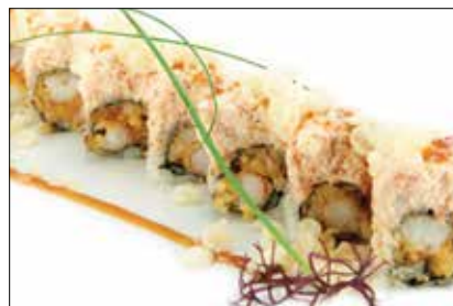
Dancing Rock Shrimp Roll $13