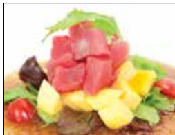
Tuna Mango Salad $12