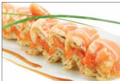
Eggplant Cha La Ca $12