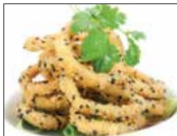
Crispy Calamari $8