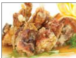
Garlic Butter Soft Shell Crab $9