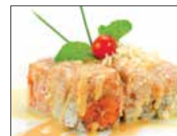
Spicy Girl Roll $12