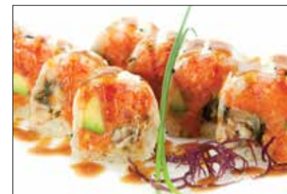
Bethpage Roll $13