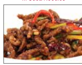
Szechuan Pepper Corn Beef