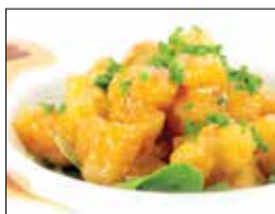
Spicy Rock Shrimp $7