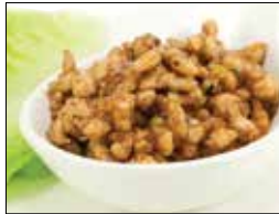
Chicken Lettuce Wrap $8