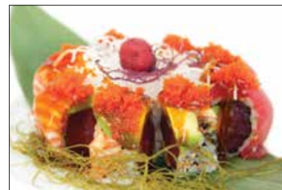
Ichiban Roll $12