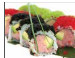
Rainbow Tobiko Roll $13