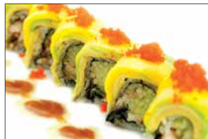
Mango Dragon Roll $12